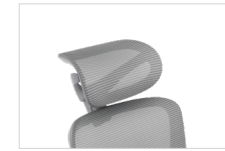
3D Headrest, 14.5in Extra-Wide