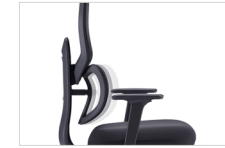
Lumbar Support, 1.65in Adjustable Depth