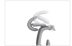
The headrest features a 40° adjustable bracket tilt angle