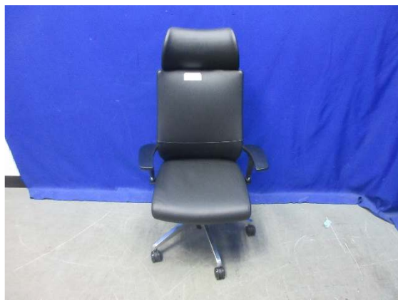
Sample as received - View 1