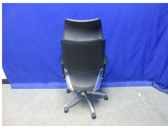
Sample as received - View 3