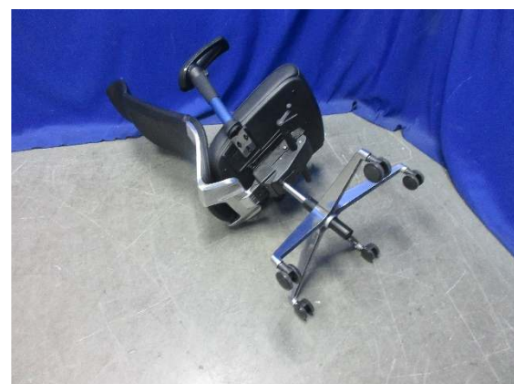
Sample as received - View 4

SGS authenticate the photo on original report only