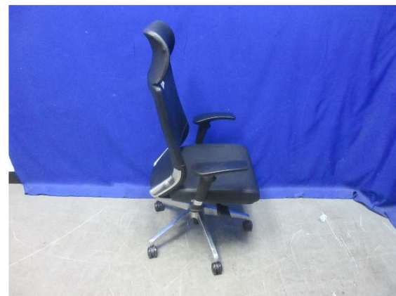
Sample as received - View 2