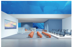
Joy and energetic