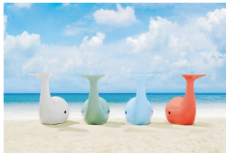
Fun for you