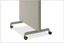
Integrated Base Stays Stable in Motion or at Rest