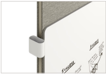
Magnetic Pen Tray for Quick, Easy Access