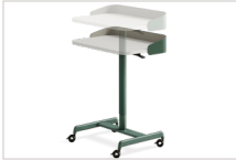
320mm Lift for Sit-Stand Flexibility