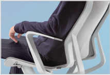
Flowing support, Arm moves with you