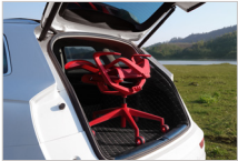
Foldable, Travel light, live low-carbon