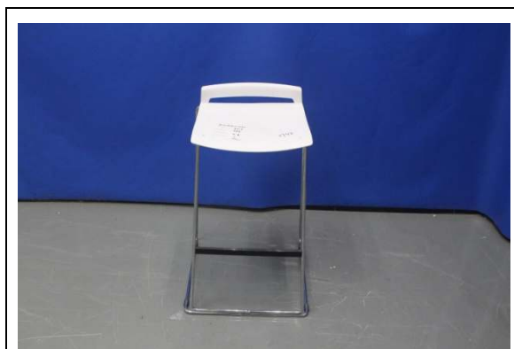
Sample as received - View 1