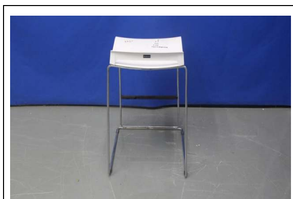
Sample as received - View 3