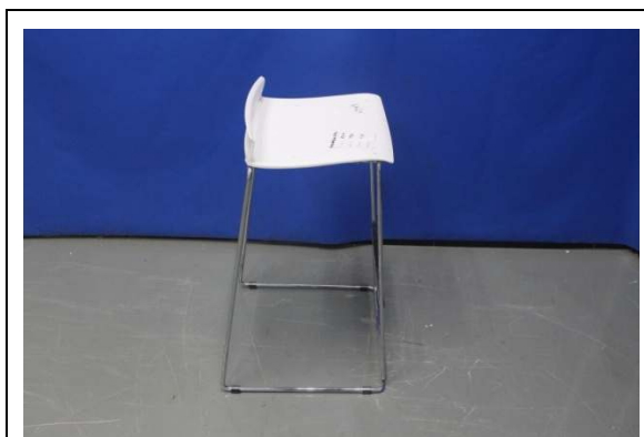
Sample as received - View 2